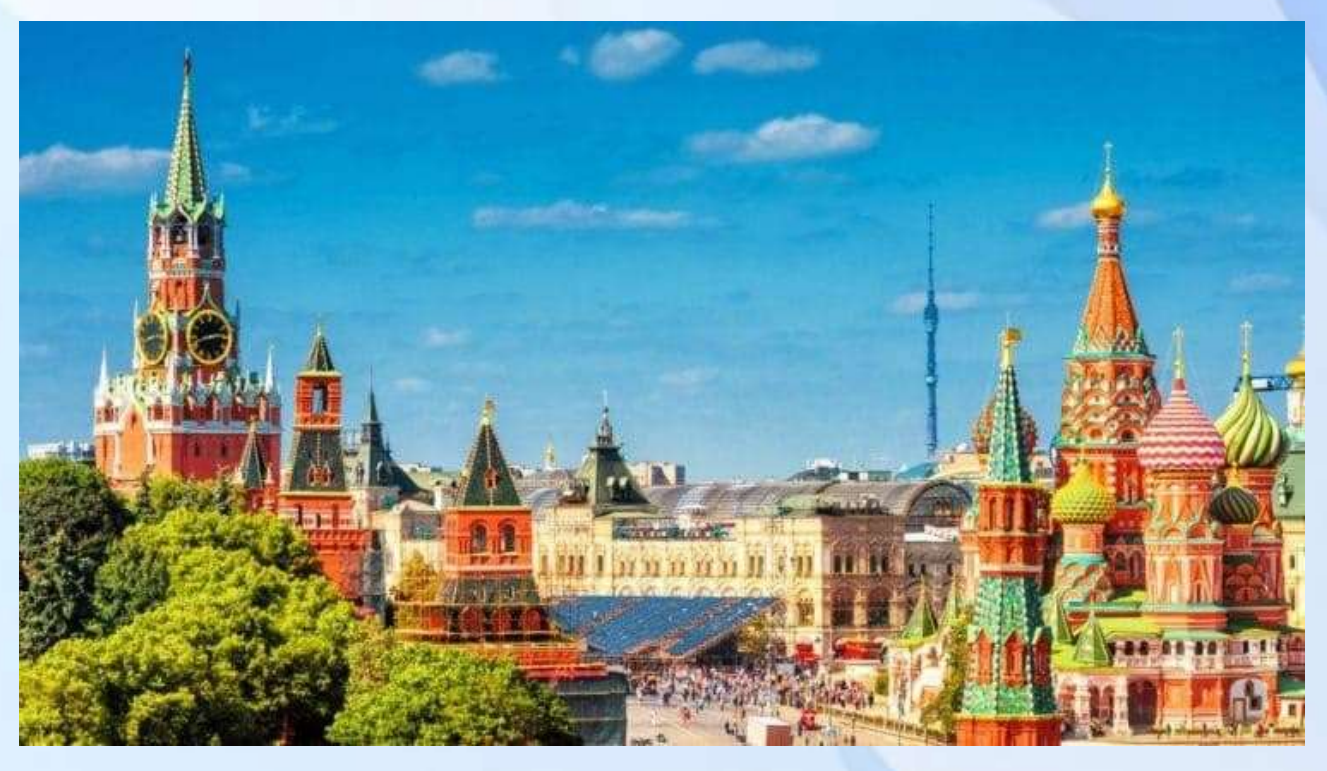
Moscow Kremlin and Red Square