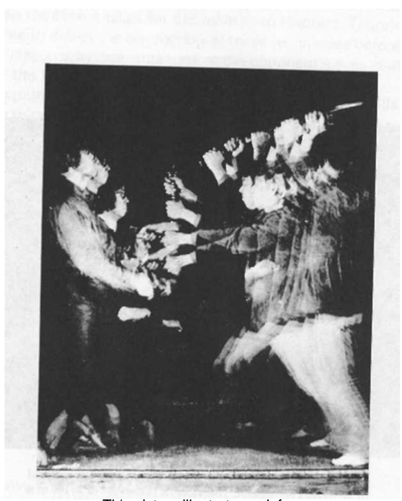
This picture illustrates a defence against a sword attack.