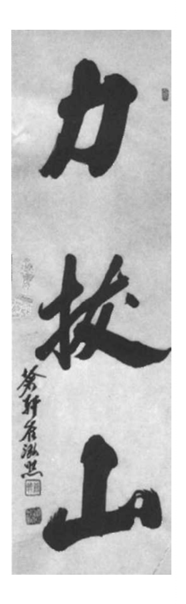
"Powerful enough to uproot mountains"

Though training will certainly result in a superb level of physical fitness, it will not necessarily result in the acquisition of extraordinary stamina or superhuman strength. More important, Taekwon-Do training will result in obtaining a high level of reaction force, concentration, equilibrium, breath control and speed; these are the factors that will result in a high degree of physical power.